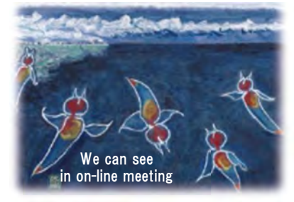
'Sea ice at Mombetsu' painted by Takao Nakajin