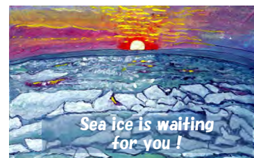
'Sea ice at Mombetsu' painted by Takao Nakajin