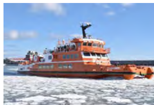
Sightseeing Icebreaker Garinko III