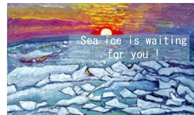
Sea ice at Mombetsu Painted by Takao Nakajin