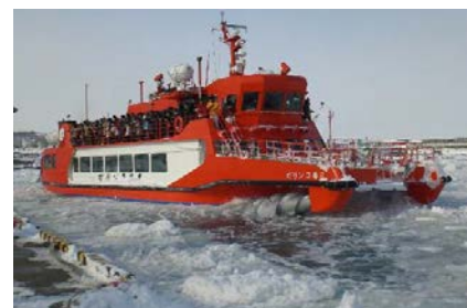
Icebreaker Garinko II