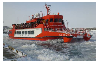
Icebreaker Garinko II