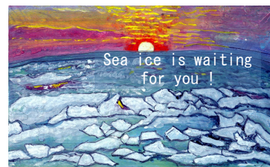
Sea ice at Mombetsu painted by T. Nakajin